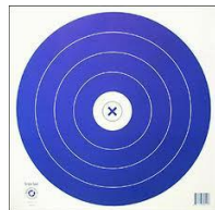
Indoor Single-spot target