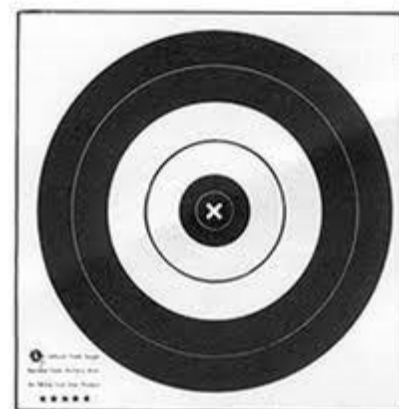
Field Round Target