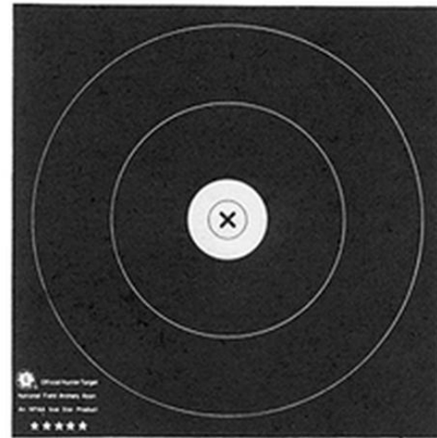
International Round Target