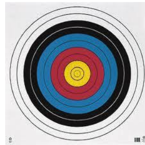
900 Round target