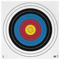
Single Spot Vegas Target