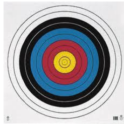
Single Spot Vegas Target